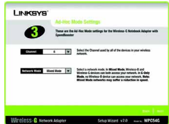
Figure 4-4: The Setup Wizard's Ad-Hoc Mode Screen

Click the Next button to continue.s. Click the Back button to return to the previous screen. Click the Help button for more information.